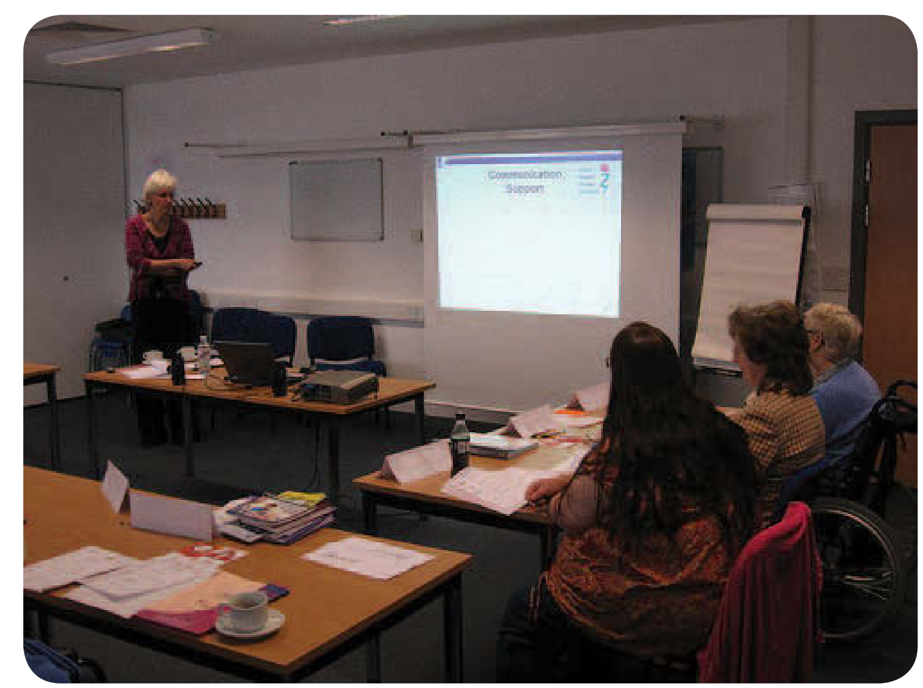
Fig 1. NHS Highland pilot

The project then engaged with three Stroke MCNs in NHS Lanarkshire, Greater Glasgow & Clyde and Highland. Taster sessions were held in two out of the three NHS Boards to recruit participants for the courses through the Volunteer Stroke Service (VSS) groups at CHSS. Many of the members in the VSS were left with communication problems after their stroke. These taster sessions also gathered the views of those not attending the training. The Stroke MCNs also put forward new and existing people from their user involvement programmes. The pilots were subsequently held in the three NHS Boards and the training and resources were then thoroughly evaluated.