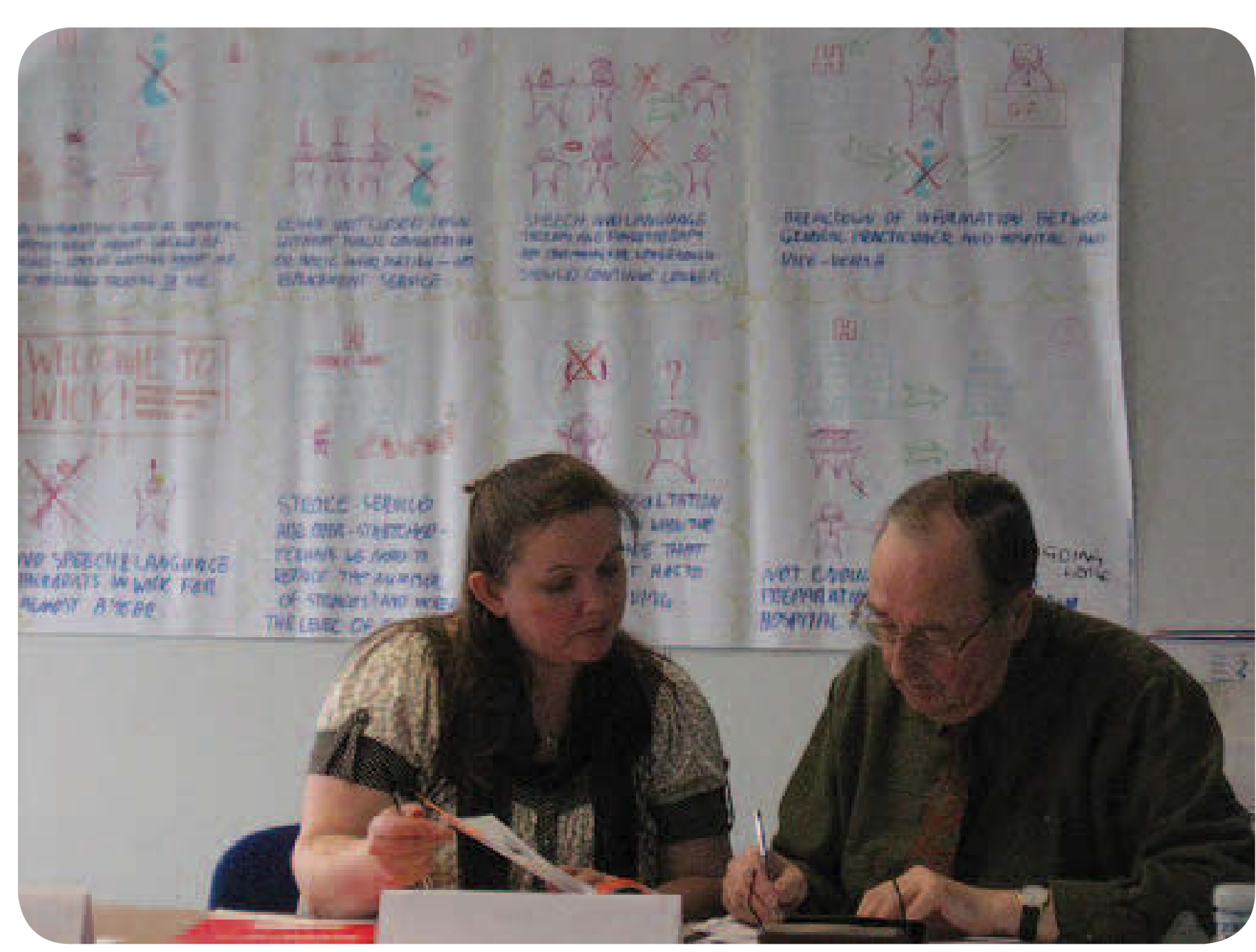
Fig 2. Graphically illustrated issues behind participants on the wall in NHS Highland

Issues were gathered throughout the training from stroke patients and carers and have been recorded in a database. Stroke Voices has also developed guidance for managers to help them support those patients who have accessibility, communication and cognitive problems and are working closely with the MCNs. This includes a Patient Involvement Toolbox of PFPI resources.