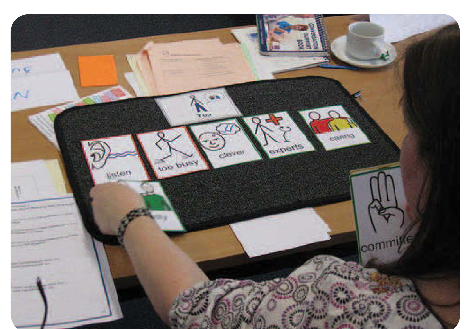
Fig 4. Widgit symbol cards for one of the Stroke Voices sessions

"As the course progressed, I found the props