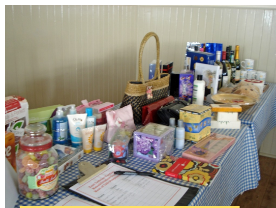
Raffles are very popular...