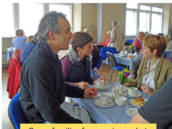
Some familiar faces enjoy a chat