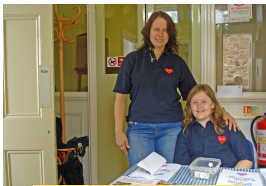
Ready to welcome the public