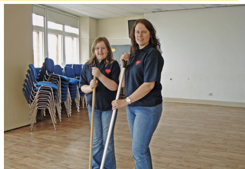
Leave the premises as you found them!

Golf events are fun, too, but the recent one escaped the notice of this roving photographer - info for the next edition welcome!