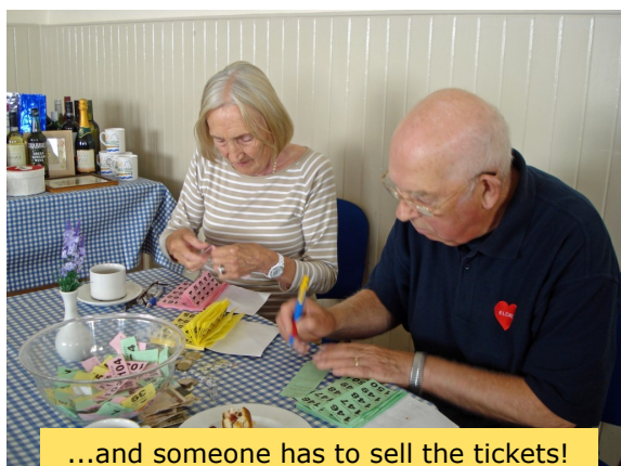
...and someone has to sell the tickets!