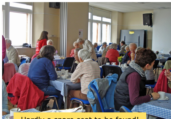
Hardly a spare seat to be found!